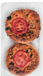
"PROVENÇALE" QUICHE WITH VEGETABLES 2x150 g Shelf life: 12 D Pieces/box: 6