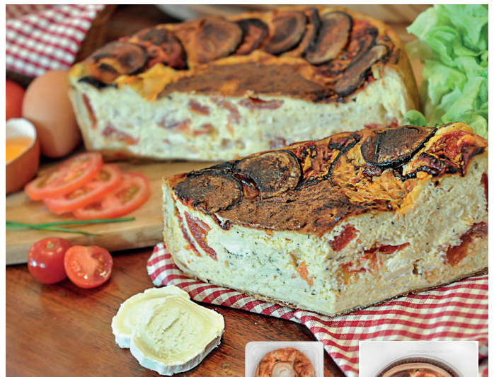
GOAT'S CHEESE AND TOMATOES QUICHE approx. 2.1 kg Item: 449 Shelf life: 12 D Pieces/box: 1