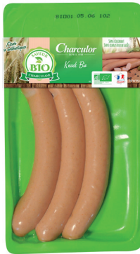
ORGANIC BEECHWOOD SMOKED KNACK 210 g Item: 2990 Shelf life: 18 D Pieces/box: 12