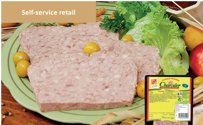
TERRINE WITH MIRABELLE PLUM

170 g Item: 2377 Shelf life: 21 D Pieces/box: 12