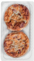
QUICHE LORRAINE 2x150 g Artikel Nr. : 5004 MHD : 16 D Stück/Karton : 6