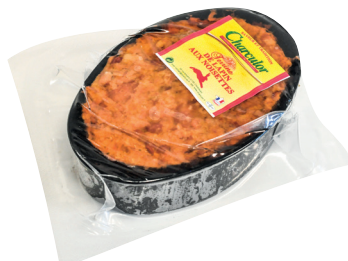
WILD BOAR TERRINE WITH PISTACHIOS

230 g Item: 2278 Shelf life: 21 D Pieces/box: 8