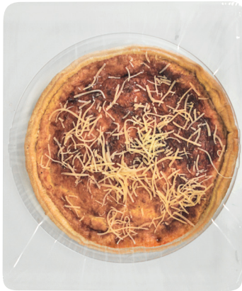
EMMENTAL CHEESE QUICHE 400 g Item: 6530 MHD 15 D Pieces/box: 6