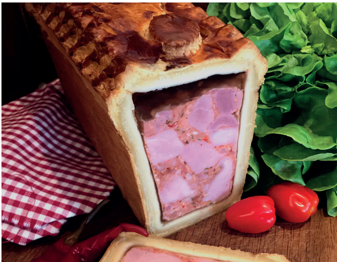
"PÂTÉ EN CROÛTE" WITH ESPELETTE PEPPER (PURE BUTTER) approx. 1.6 kg Item: 542 Shelf life: 6 D Pieces/box: 3