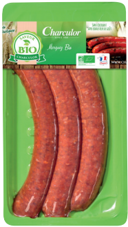
ORGANIC MERGUEZ X3 210 g Item: 2982 Shelf life: 10 D Pieces/box: 12