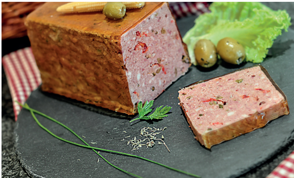
TERRINE "PROVENÇALE" approx. 1 kg Item: 468 Shelf life: 18 D Pieces/box: 2