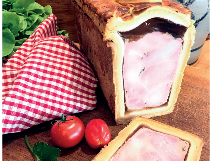
"PÂTÉ EN CROÛTE" WITH CHICKEN AND GIROLLES (PURE BUTTER) approx. 1.6 kg Item: 538 Shelf life: 6 D Pieces/box: 3