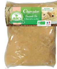
ORGANIC ALSACE SAUERKRAUT COOKED WITH WHITE WINE 600 g Item: 2980 Shelf life: 30 D Pieces/box: 20