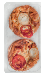
GOAT'S CHEESE AND TOMATOES QUICHE 2x150 g Shelf life: 12 D Pieces/box: 6