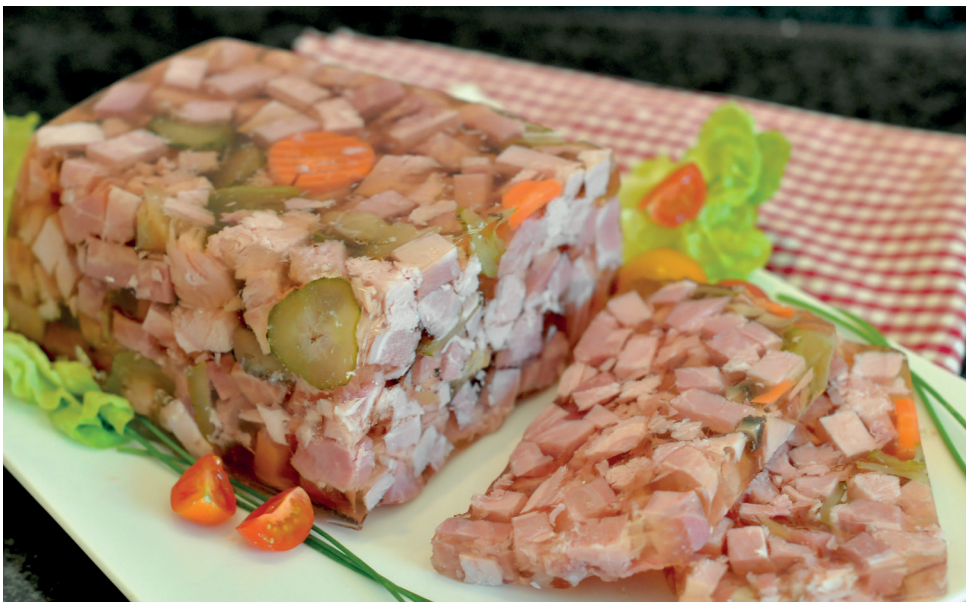
HAM ASPIC approx. 1.8 kg Item: 266 Shelf life: 14 D Pieces/box: 1