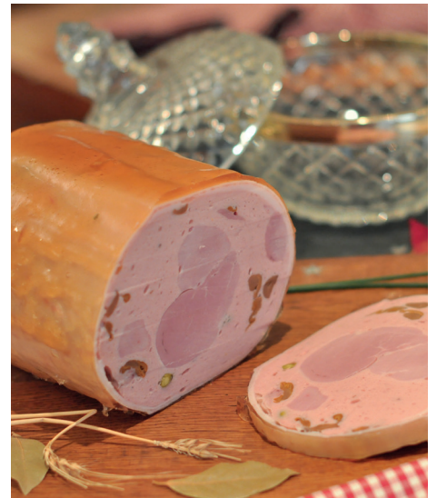
"BALLOTINE" WITH PORK FILLET IN ASPIC approx. 1.9 kg Item: 249 MHD 25 D Pieces/box:2