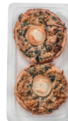
LEEK AND GOAT'S CHEESE QUICHE 2x150 g Shelf life: 12 D Pieces/box: 6