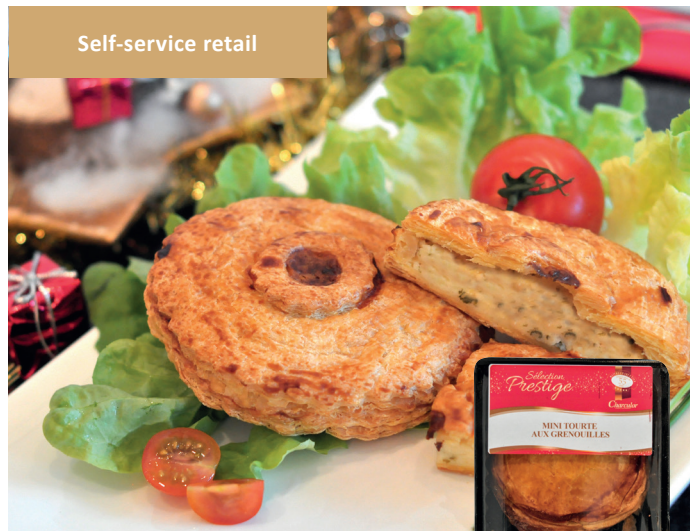
MINI FROG PIE 2x120 g Item: 5553 Shelf life: 15 D Pieces/box: 6