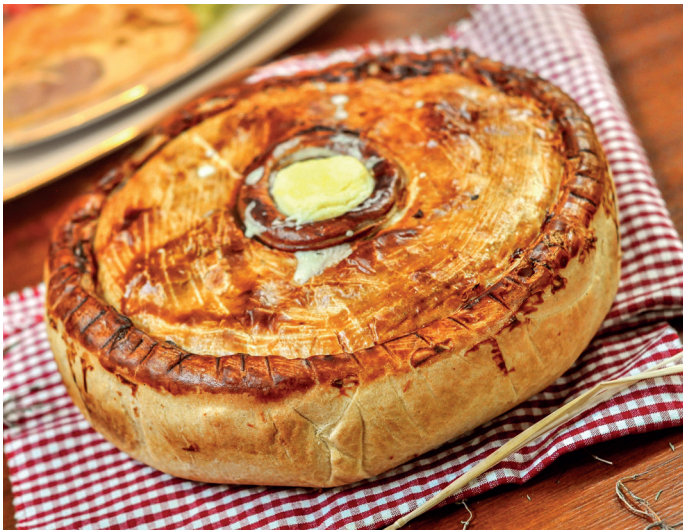
LORRAINE PIE WITH PORK AND VEAL (PURE BUTTER) approx. 3 kg Item: 421 Shelf life: 6 D Pieces/box: 1