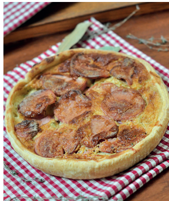
MEAT SAUSAGE AND BROCCOLI QUICHE 400 g Item: 6532 MHD 15 D Pieces/box: 6