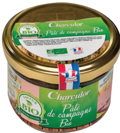
ORGANIC COUNTRY STYLE TERRINE 200 g Shelf life: 90 j Pieces/box: 6