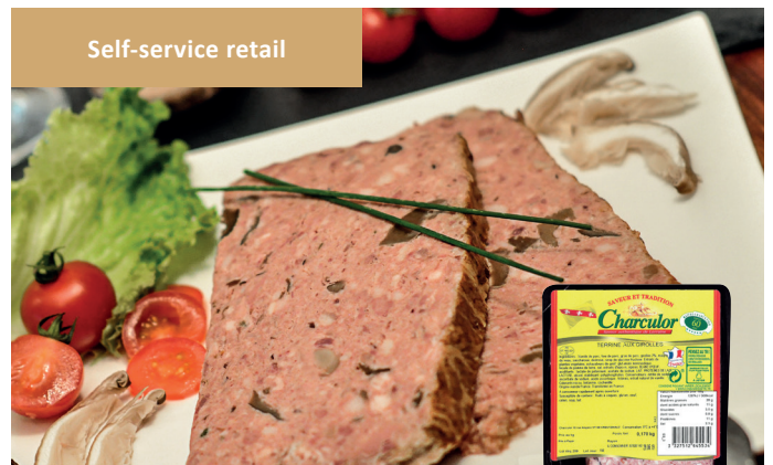
TERRINE WITH GIROLLES

170 g Item: 2378 Shelf life: 21 D Pieces/box: 12