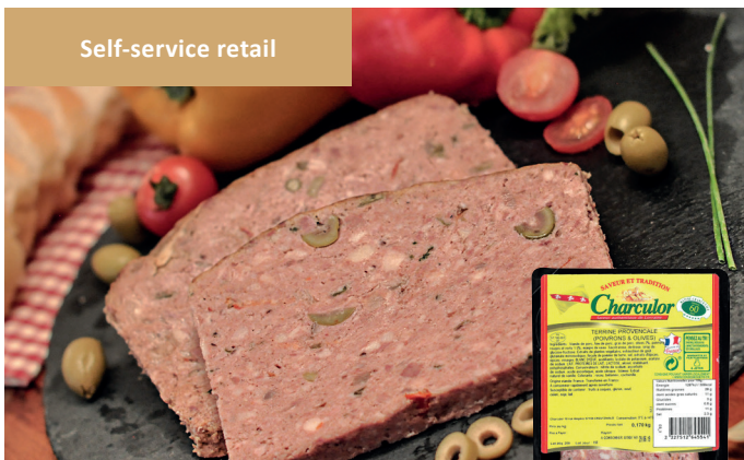
"PROVENÇALE" TERRINE (SWEET PEPPERS AND OLIVES)

170 g Item: 2379 Shelf life: 21 D Pieces/box: 12