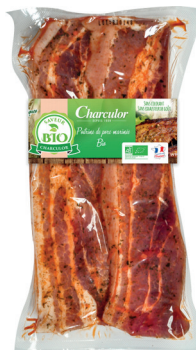
ORGANIC MARINATED BACON X2 approx. 250 g Item: 2984 Shelf life: 18 D Pieces/box: 12