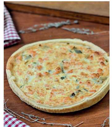
SALMON AND LEEK QUICHE 400 g Item: 6533 MHD 15 D Pieces/box: 6