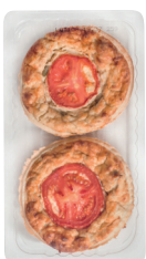
TUNA, MUSTARD AND CHIVE QUICHE 2x150 g Shelf life: 12 D Pieces/box: 6