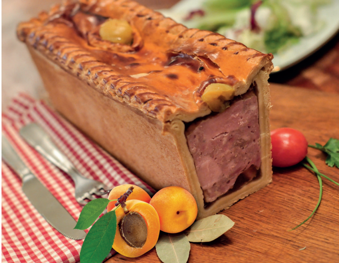
"PÂTÉ EN CROÛTE" WITH MIRABELLE PLUM (PURE BUTTER) approx. 1.6 kg Item: 539 Shelf life: 6 D Pieces/box: 3