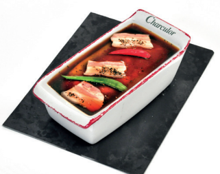
"TERRINE D'AUTREFOIS" WITH THREE PEPPERS approx. 2.5 kg Item: 270 Shelf life: 21 D Pieces/box: 1