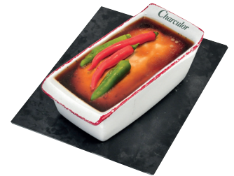
"TERRINE D'AUTREFOIS" WITH ESPELETTE PEPPER approx. 2.5 kg Item: 264 Shelf life: 21 D Pieces/box: 1