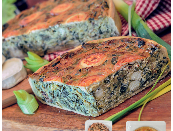
LEEK AND GOAT'S CHEESE QUICHE approx. 2.1 kg Item: 440 Shelf life: 12 D Pieces/box: 1