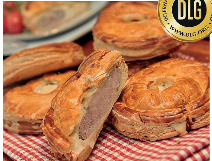
LORRAINE PIE 8x180 g Item: 425 Shelf life: 15 D Pieces/box: 3