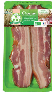
ORGANIC BEECHWOOD SMOKED BACON - 2 SLICES approx. 250 g Item: 2989 Shelf life: 30 D Pieces/box: 12