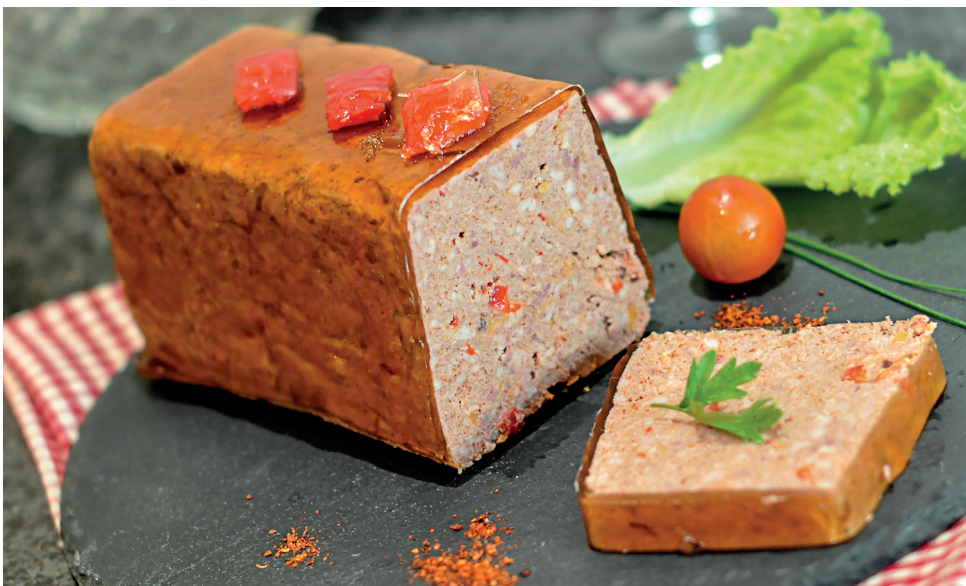
TERRINE WITH ESPELETTE PEPPER approx. 1 kg Item: 479 Shelf life: 18 D Pieces/box: 2