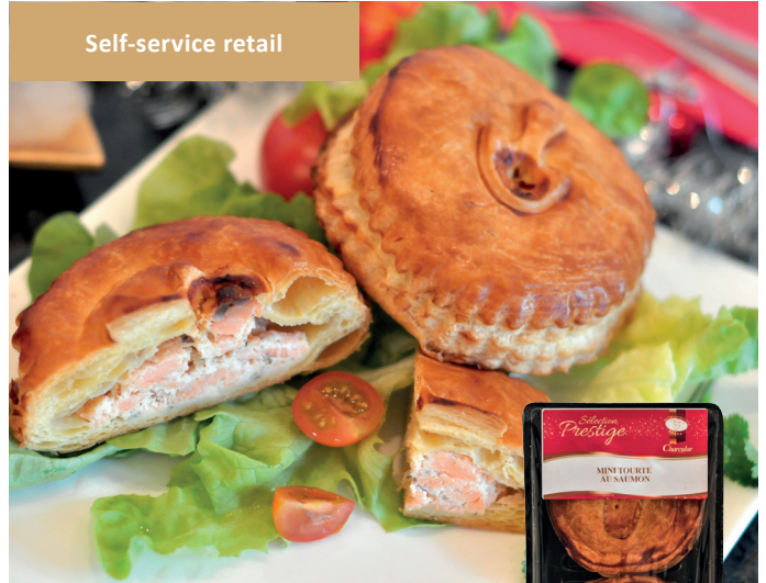
MINI SALMON PIE 2x120 g Item: 5551 Shelf life: 15 D Pieces/box: 6