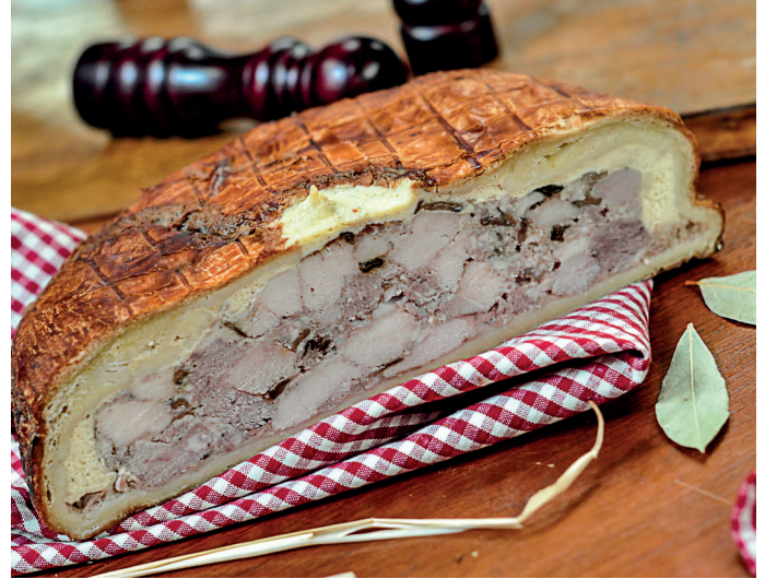
RUSTIC PIE WITH CEPES AND RIESLING (PURE BUTTER) approx. 3 kg Item: 423 Shelf life: 6 D Pieces/box: 1