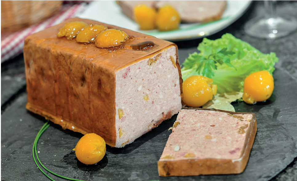
TERRINE WITH MIRABELLE PLUM approx. 1 kg Item: 497 Shelf life: 18 D Pieces/box: 2