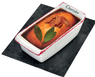
"TERRINE D'AUTREFOIS" WITH DRIED TOMATOES approx. 2.5 kg Item: 263 Shelf life: 21 D Pieces/box: 1