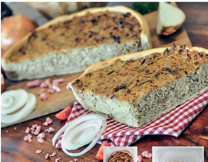
ONION PIE approx. 2.1 kg Item: 441 Shelf life: 12 D Pieces/box: 1