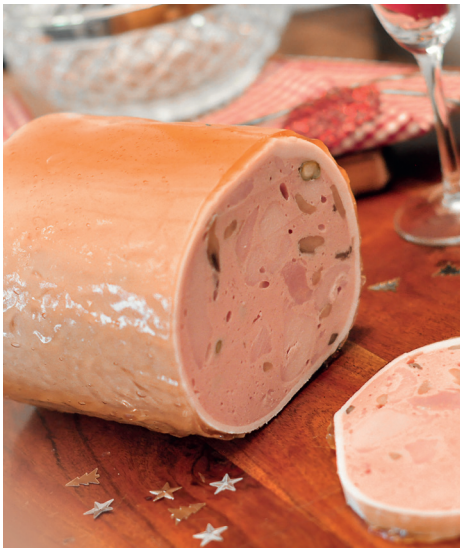
"BALLOTINE" WITH TURKEY AND PISTACHIOS IN ASPIC approx. 1.9 kg Item: 239 MHD 25 D Pieces/box:2