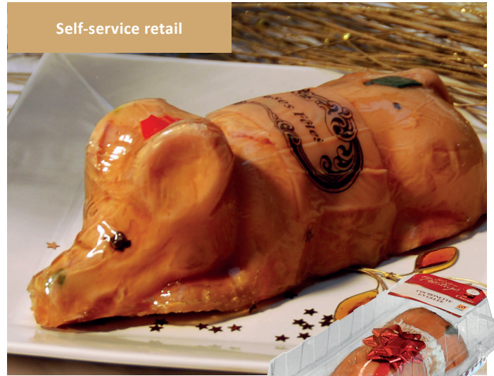
SUCKLING PIG SHAPED GALANTINE 600 g Item: 2333 Shelf life: 25 D Pieces/box: 4