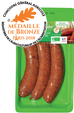
ORGANIC BEECHWOOD BOILED SAUSAGE 210 g Item: 2991 Shelf life: 18 D Pieces/box: 12