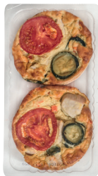
CHICKEN, CARROTS, ZUCCHINI AND CURRY QUICHE 2x150 g Shelf life: 12 D Pieces/box: 6