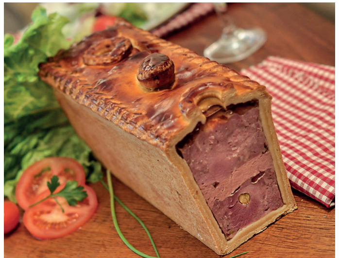
"PÂTÉ EN CROÛTE" RICHELIEU (PURE BUTTER) approx. 1.6 kg Item: 588 Shelf life: 6 D Pieces/box: 3