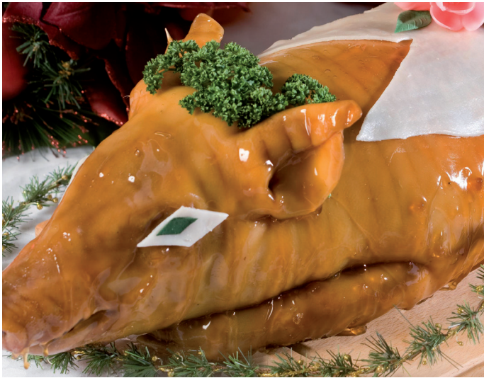
STUFFED SUCKLING PIG approx. 10 kg Item: 159 Shelf life: 10 D Pieces/box: 1