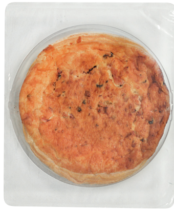
QUICHE LORRAINE 400 g Item: 6531 MHD 15 D Pieces/box: 6