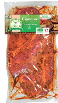
ORGANIC MARINATED SPARE RIBS X2 approx. 350 g Item: 2983 Shelf life: 18 D Pieces/box: 12