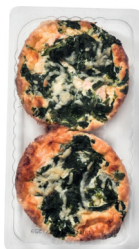
SALMON AND SPINACH QUICHE 2x150 g Shelf life: 12 D Pieces/box: 6