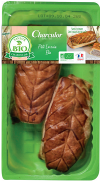
ORGANIC "PÂTE LORRAINE" X2 300 g Shelf life: 15 D Pieces/box: 6