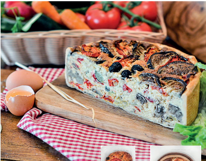
"PROVENÇALE" QUICHE WITH VEGETABLES approx. 2.1 kg Item: 430 Shelf life: 12 D Pieces/box: 1