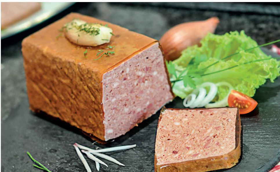
TERRINE WITH SHALLOTS approx. 1 kg Item: 478 Shelf life: 18 D Pieces/box: 2