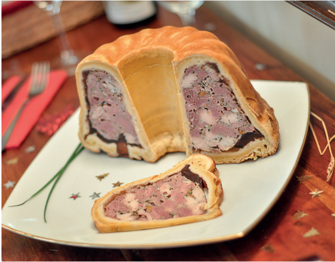
"PÂTE EN CROÛTE" WITH CHICKEN AND GIROLLES