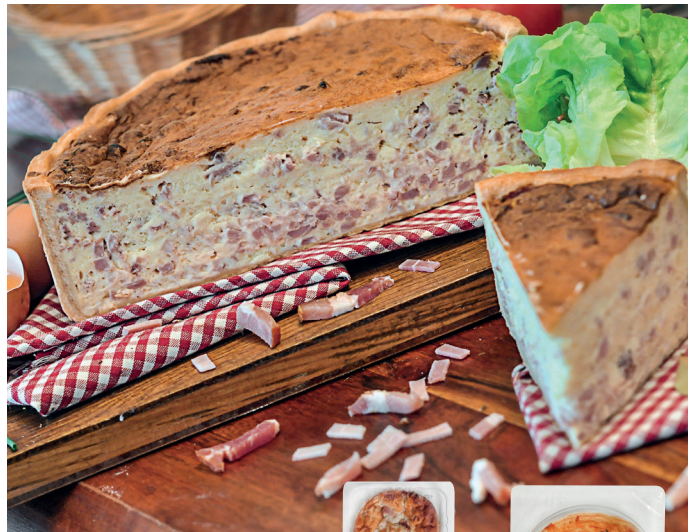
QUICHE LORRAINE approx. 2.1 kg Item: 432 Shelf life: 12 D Pieces/box: 1