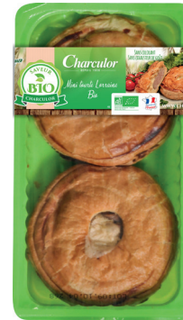
ORGANIC MINI LORRAINE PIE X2 360 g Shelf life: 15 D Pieces/box: 6