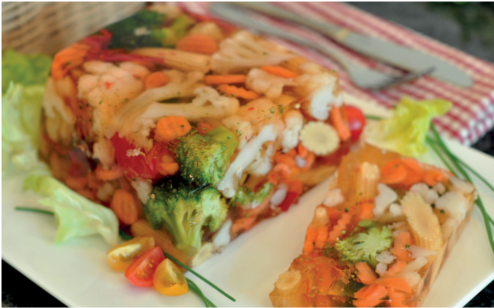
VEGETABLE ASPIC approx. 1.8 kg Item: 267 Shelf life: 14 D Pieces/box: 1