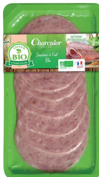
ORGANIC GARLIC SAUSAGE 6 slices Shelf life: 20 D Pieces/box: 12