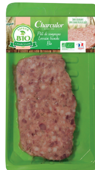
ORGANIC COUNTRY STYLE TERRINE 170 g Shelf life: 10 j Pieces/box: 12