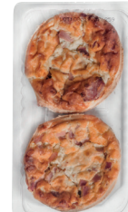
EMMENTAL CHEESE QUICHE 2x130 g Artikel Nr. : 5015 MHD : 16 D Stück/Karton : 6