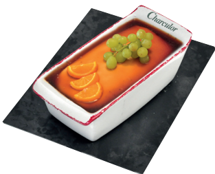
"TERRINE D'AUTREFOIS" WITH GEWURZTRAMINER AND GIROLLES approx. 2.5 kg Item: 271 Shelf life: 21 D Pieces/box: 1