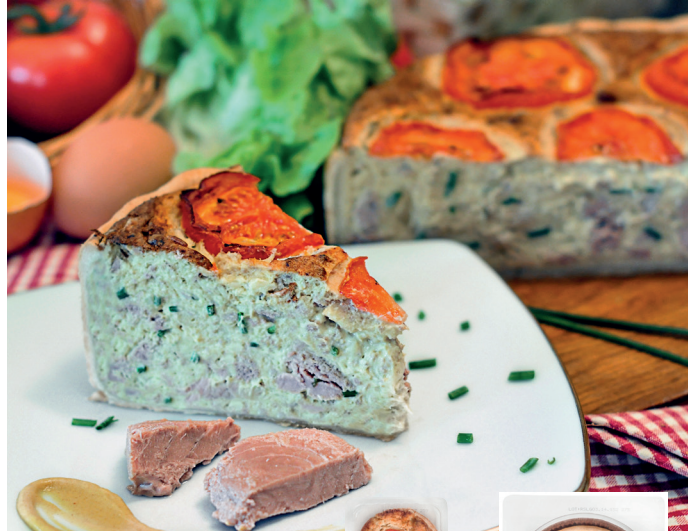
TUNA, MUSTARD AND CHIVE QUICHE approx. 2.1 kg Item: 429 Shelf life: 12 D Pieces/box: 1