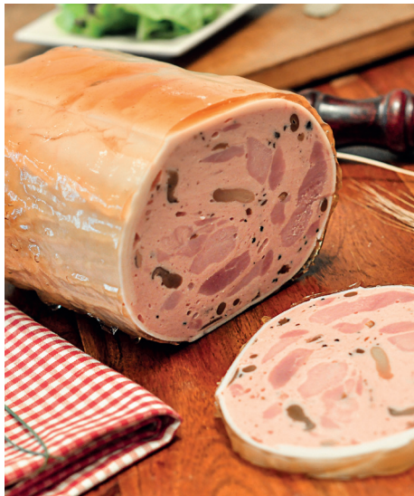
"BALLOTINE" WITH TRUFFLE IN ASPIC (TUBER BRUMALE 1%) approx. 1.9 kg Item: 237 MHD 25 D Pieces/box:2