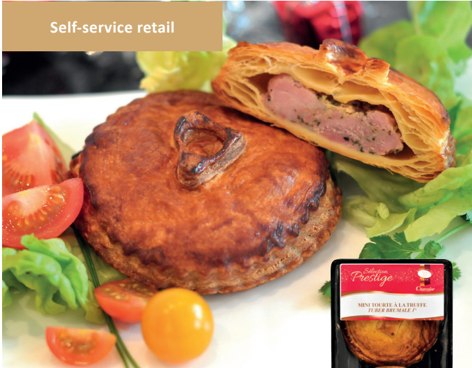
MINI TRUFFLE PIE (TUBER BRUMALE 1%) 2x120 g Item: 5550 Shelf life: 15 D Pieces/box: 6