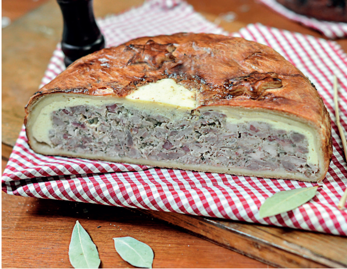
PIE WITH MEAT AND MUNSTER CHEESE (PURE BUTTER) approx. 3 kg Item: 422 Shelf life: 6 D Pieces/box: 1