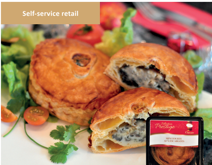
MINI SNAILS PIE 2x120 g Item: 5552 Shelf life: 15 D Pieces/box: 6