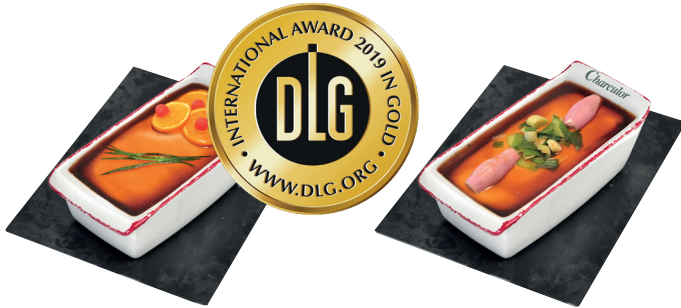
"TERRINE D'AUTREFOIS" COUNTRY STYLE approx. 2.5 kg Item: 260 Shelf life: 21 D Pieces/box: 1