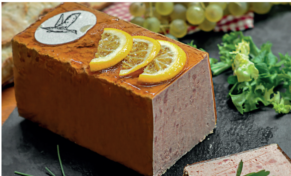
CREAM OF DUCK LIVER approx. 1 kg Item: 484 Shelf life: 18 D Pieces/box: 2