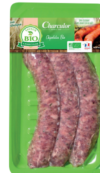
ORGANIC CHIPOLATA X3 210 g Item: 2981 Shelf life: 10 D Pieces/box: 12

WITHOUT COLOURING... AND WITHOUT FLAVOR ENHANCER