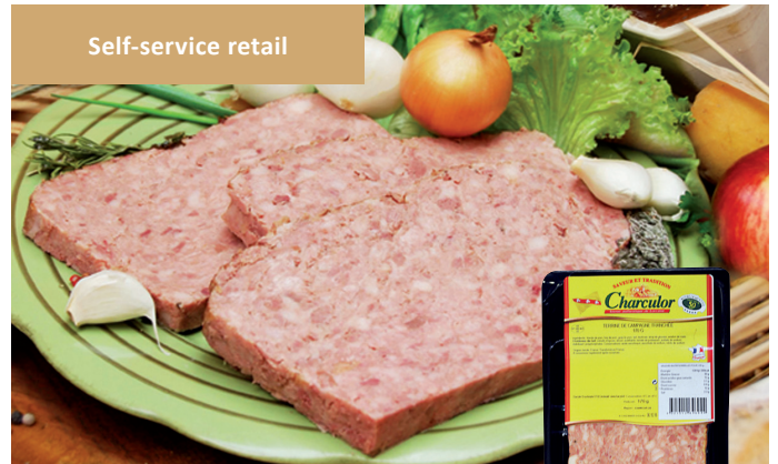
COUNTRY STYLE TERRINE

170 g Item: 2280 Shelf life: 21 D Pieces/box: 12