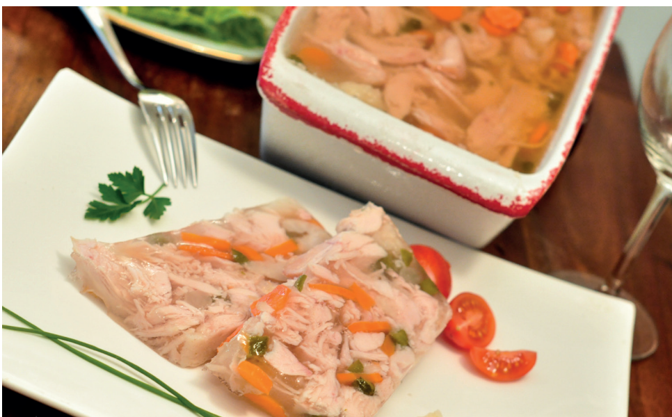
CHICKEN ASPIC WITH MOSELLE WINE approx. 2.8 kg Item: 390 Shelf life: 21 D Pieces/box: 1