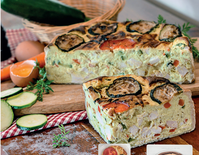
CHICKEN, CARROTS, ZUCCHINI AND CURRY QUICHE approx. 2.1 kg Item: 428 Shelf life: 12 D Pieces/box: 1