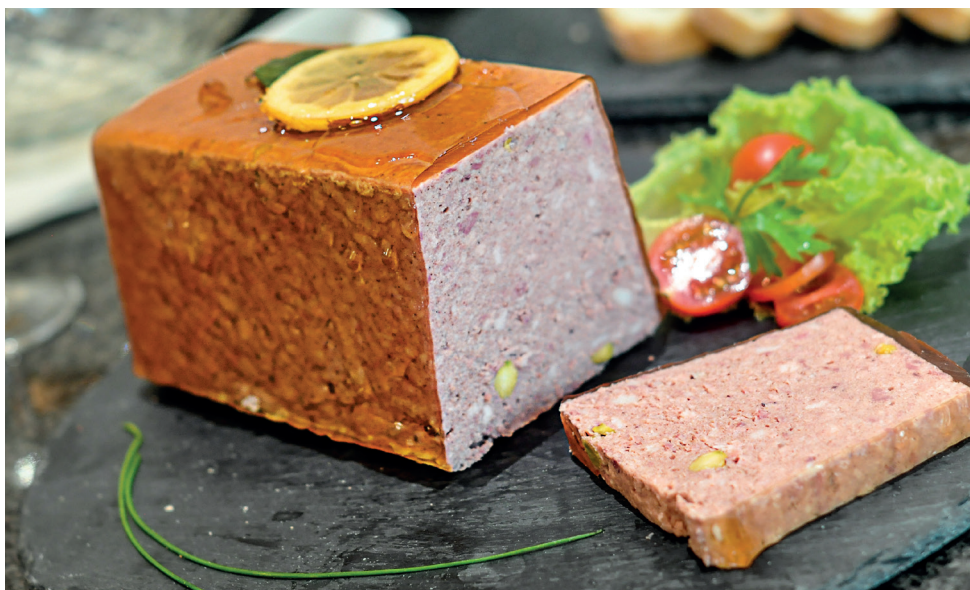
TERRINE WITH "GRIS DE TOUL" WINE approx. 1 kg Item: 496 Shelf life: 18 D Pieces/box: 2