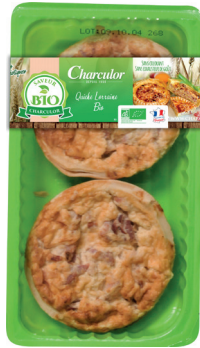
ORGANIC "QUICHE LORRAINE" X2 300 g Shelf life: 16 D Pieces/box: 6