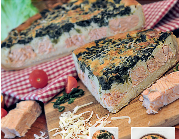
SALMON AND SPINACH QUICHE approx. 2.1 kg Item: 439 Shelf life: 12 D Pieces/box: 1