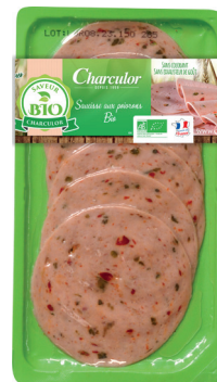
ORGANIC SWEET PEPPER SAUSAGE 6 slices Shelf life: 20 D Pieces/box: 12

WITHOUT COLOURING... AND WITHOUT FLAVOR ENHANCER