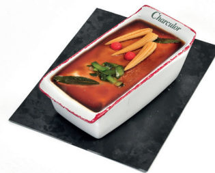
"TERRINE D'AUTREFOIS" WITH "GRIS DE TOUL" WINE approx. 2.5 kg Item: 262 Shelf life: 21 D Pieces/box: 1