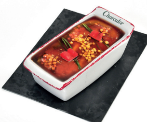
"TERRINE D'AUTREFOIS" WITH BEER approx. 2.5 kg Item: 265 Shelf life: 21 D Pieces/box: 1