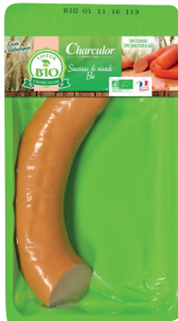
ORGANIC BEECHWOOD SMOKED MEAT SAUSAGE approx. 250 g Item: 2992 Shelf life: 21 D Pieces/box: 12