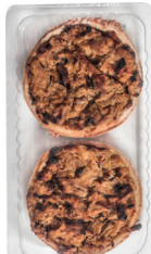
ONION PIE 2x150 g Shelf life: 12 D Pieces/box: 6